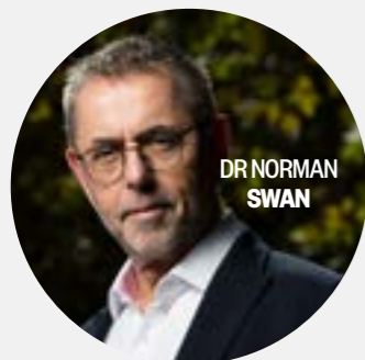
DR NORMAN SWAN