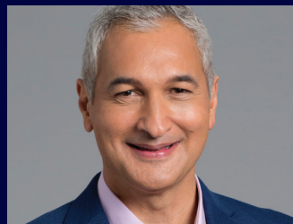
Mike McRoberts (MC)

Former CEO of Air New Zealand and Icebreaker