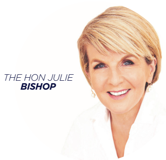
THE HON JULIE BISHOP