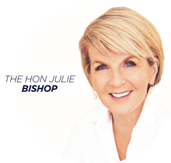
THE HON JULIE BISHOP