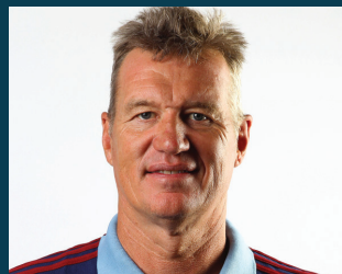
Sir John Kirwan Former All Black, Author and Mental Health Expert