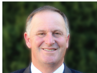
Rt Hon Sir John Key Former Prime Minister of New Zealand