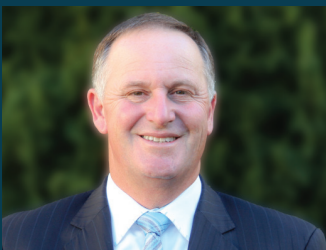
Rt Hon Sir John Key former Prime Minister of New Zealand