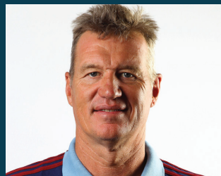
Sir John Kirwan Former All Black, Author and Mental Health Expert