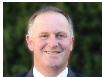
Rt Hon Sir John Key Former Prime Minister of New Zealand