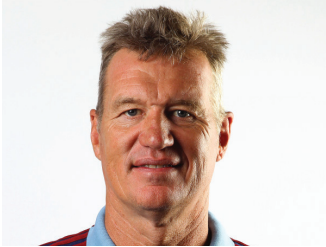
Sir John Kirwan MBE Former All Black, Author and Mental Health Expert

Sir John Kirwan KNZM MBE is one of the highest try scorers in international rugby union history, having played 96 games for the All Blacks. In 1989, Sir John received a MBE for services to rugby, and in 2012 he became a Knight Companion of the NZ Order of Merit for his services to mental health. He speaks openly about his personal battle with anxiety and depression and how fostering mental wellbeing is something that needs to be put at the top of the business agenda.