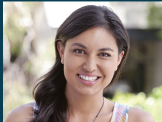
Nadia Lim Celebrity Chef, Nutritionist and Author