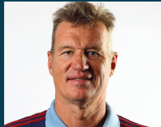
Sir John Kirwan Former All Black, Author and Mental Health Expert